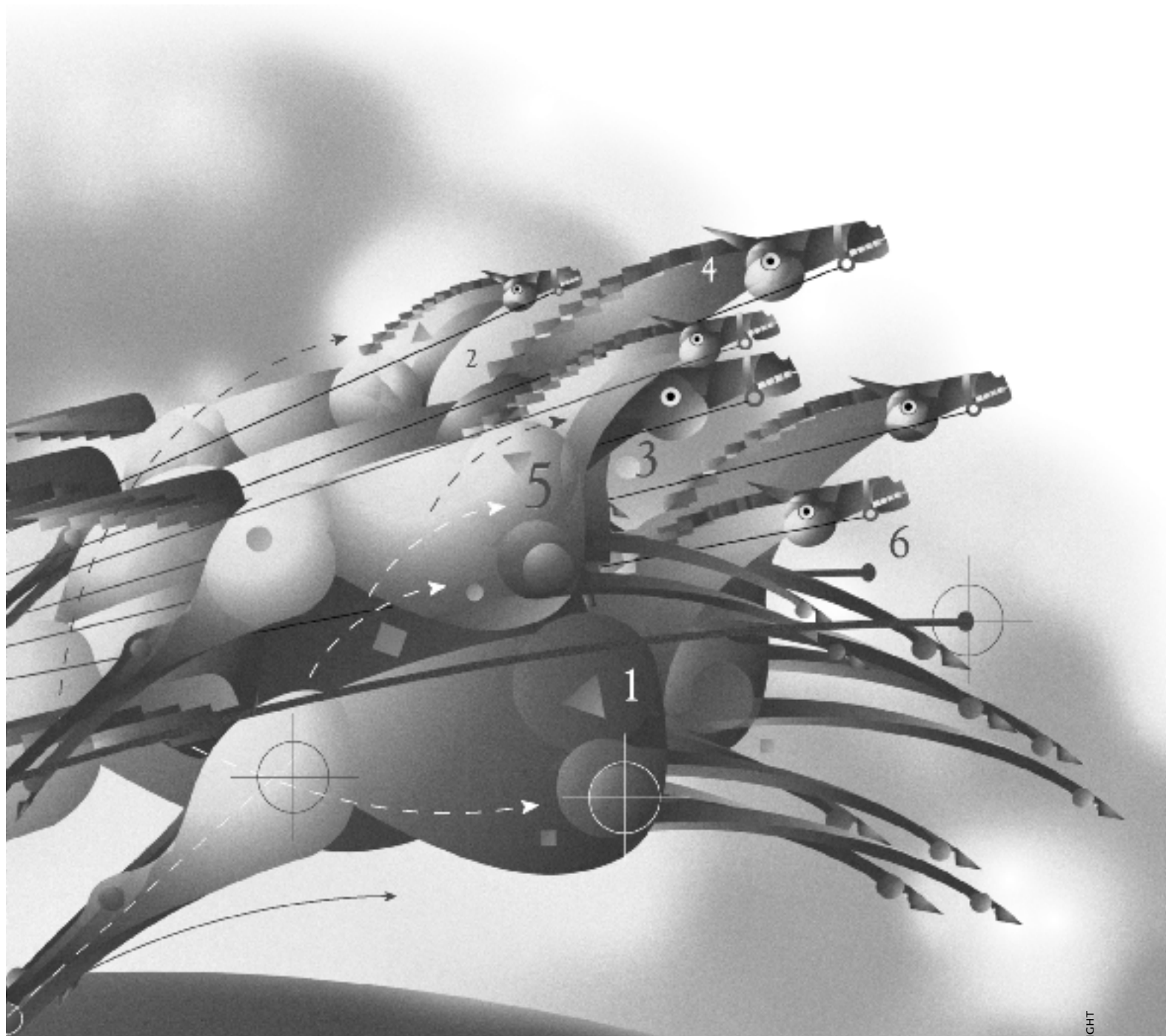
ILLUSTRATION: SCOTT WRIGHT

No leader can succeed without mastering the art of persuasion. But there's hard science in that skill, too, and a large body of psychological research suggests there are six basic laws of winning friends and influencing people.